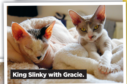
King Slinky with Gracie.