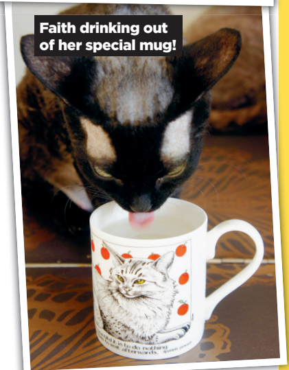
Faith drinking out of her special mug!