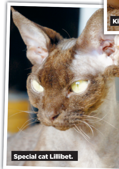
Special cat Lilibet.